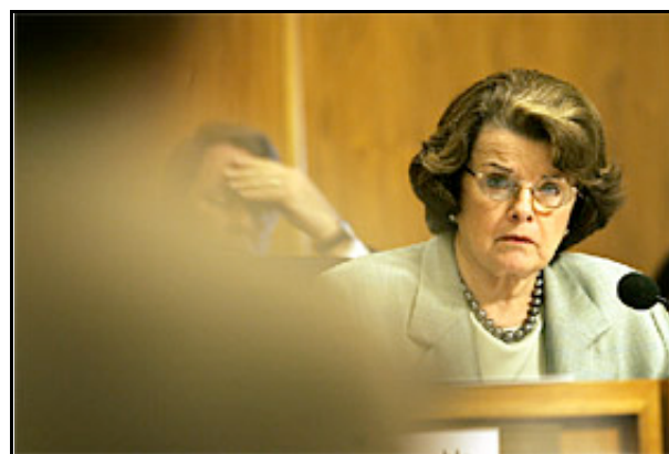
Sen. Dianne Feinstein, D-Calif., said yesterday that more firefighting resources are necessary to prevent "a loss of life on a major scale."

"Obviously, the fire wasn't fought there," she said.